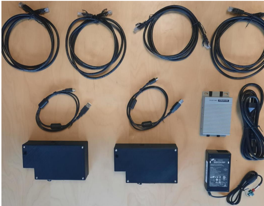
Fig. 2. DOME Starter kit contents